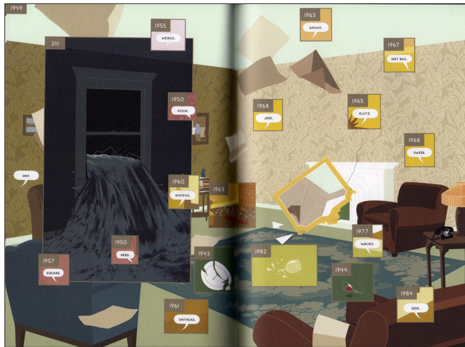
Figure 2: 'Drip.' McGuire, R., 2014. Here . New York: Pantheon Books. Available at: http://theaccountmagazine.com/wp-content/uploads/2015/05/Fig-5-3.jpeg .

a tarpaulin. 18 These are futile attempts to impose order on this landscape, it turns out, as a panel dated a year later appears to show the tarpaulin blowing away in the wind. Visually, these gestures resemble picnickers attempting to snag a blanket. Yet the quotidian postures are complicated by the framing that works to make these human subjects anonymous, faceless, and fleeting. Sure enough, these human chronologies are entirely absent from the panel dated 22,175 AD, the latest date depicted in the text. In this far future, hummingbirds commingle against a backdrop of lush, vibrantly colored pink flowers and large dinosaur-like figures. In 2006, the human desire for communication, a disembodied speech bubble asks, 'Hello? I didn't hear a beep. I hope I'm leaving a message.' The panels present a cluster of potential