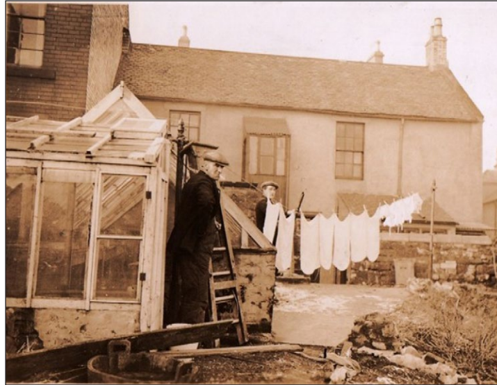
Figure 5: Area 7, Dean Lane & Boyd Street.

And yet of course on a fundamental level it was. All writing is autobiographical, even when we pretend it isn't.