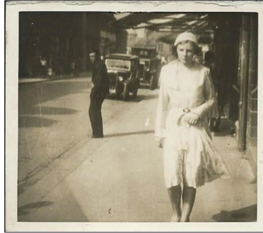
Figure 3: Betty , Sauchiehall Street.

of this action. 2 The interpretative and narrative gesture that Hirsch describes takes place later on, in the process of writing. It is no accident that the photos Galloway describes are not themselves reproduced, although the covers of both books do use images of her as a child and young woman. Besides, she has warned us already that the text we are reading is 'All Made Up'. For all we know, the photos themselves may be invented or amalgamated from similar images. Either way, they are the prompt for the story she goes on to tell.