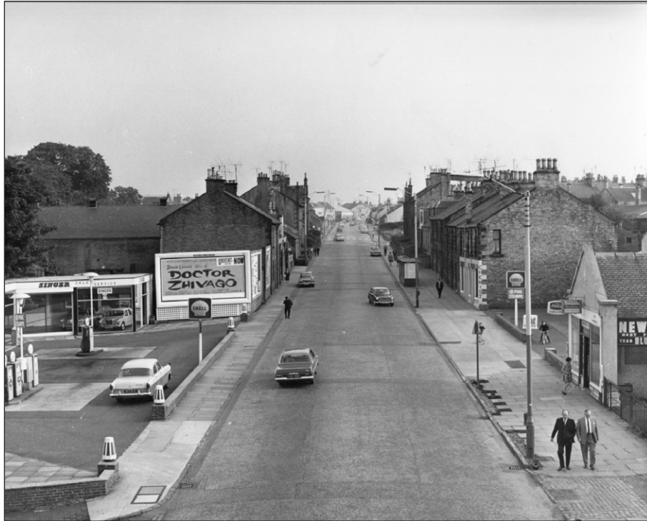
Figure 4: Campbell Street.

In Photography, Narrative, Time Greg Batty suggests that, 'Photography's unusual relationship with time, and our uniquely human preoccupation with time and time's consequences, make for the presence of unexpected kinds of meaning in some photographs, including narrative and fictional meanings not hitherto conceived of as possible for a medium seemingly limited to the depiction of durationless instants' (Batty 2014, 54). 3