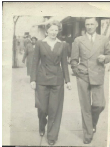
Figure 1: Largs , July 1943.

Street photographers were a feature of seaside towns in Britain from the 1850s until the 1950s and beyond. Their heyday was in the 1930s. On the August Bank Holiday of 1939, the fifty 'reflex men' working for Sunbeam Photos of Margate took